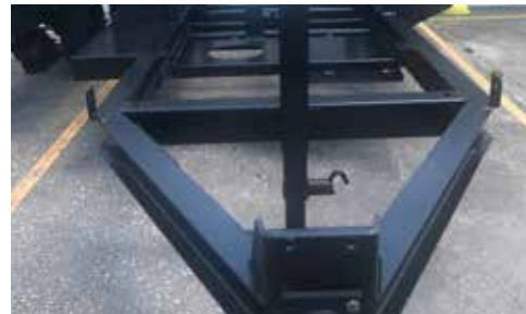
I BEAM TRAILER Units are built from start to finish at our factory, including the trailer which consists of a sturdy I-Beam construction.