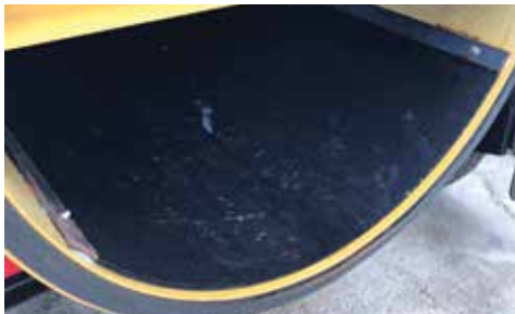
POLYMER LINER The polymer liner lines the bottom half of the debris tank for easy dumping and clean out.