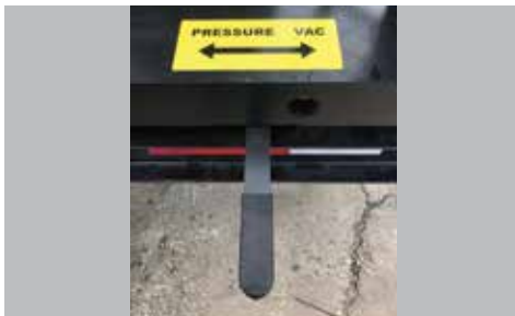
REVERSE PRESSURE (OPTIONAL) Reverse Pressure to off-load liquids and dislodge debris in hose.