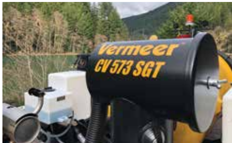
0.5 MICRON FILTRATION Cyclonic filtration separator as well as a secondary filter to clean the air down to 0.5 microns.