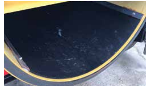
POLYMER LINER The polymer liner inside the debris tank on the bottom half makes for easy dumping and cleanout.