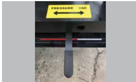
REVERSE PRESSURE Reverse Pressure to off-load liquids and dislodge debris in hose is standard.