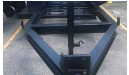
I BEAM TRAILER Units are built from start to finish at our factory, including the trailer which consists of a sturdy I-Beam construction.