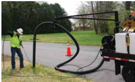
STRONG ARM (OPTION) With 270-degree rotation, the strong arm supports the weight of the vacuum hose and the roller head makes handling much easier by allowing smooth, fluid movements and adjustments.